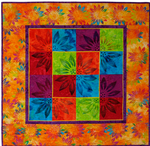
Finished Quilt Size: 34½" x 34½"