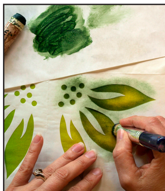
C: Stencil design with brush and paintstik color.