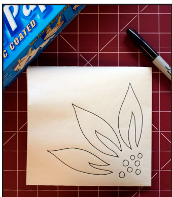
A: Transfer design to folded freezer paper.