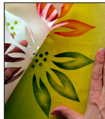
D: Carefully remove freezer paper from stenciled fabric.