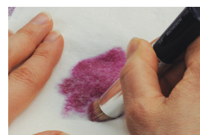
Clean brushes with CitraSolv