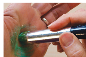
Clean brushes with Cedar Canyon Brush Soap